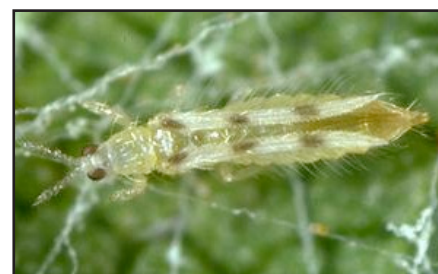
Figure 8. The six-spotted thrips feeds on spider mites and their eggs.