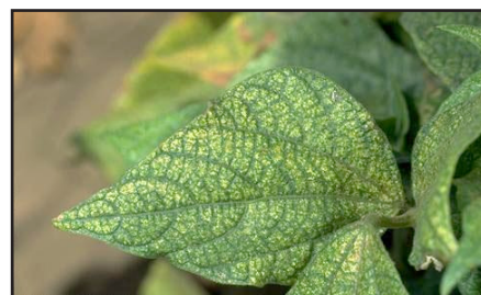
Figure 6. Feeding by webspinning mites first appears as leaf stippling.

The purchase and release of predatory mites can be useful in establishing populations in large plantings or orchards, but the best results are obtained by creating favorable conditions for naturally occurring predators, such as avoiding dusty conditions and insecticide sprays. The major predator mites commercially available for release are the western predatory mite and Phytoseiulus .