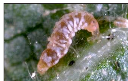
Figure 9. Larvae of predatory midges, such as this Feltiella species, prey on spider mites.

The western predatory mite is more effective under hot, dry conditions. These predators don't feed on foliage or become pests; thus if pest mites aren't available when predatory mites are released, the predators starve or migrate elsewhere.