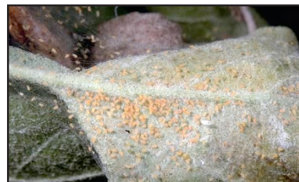
Figure 2. Mite colony on underside of leaf.