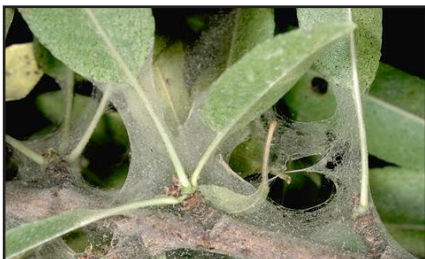
Figure 3. Webspinning mites can produce copious amounts of webbing.