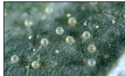
Figure 4. Twospotted spider mite eggs.