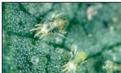
Figure 1. Spider mites.

Adult mites have eight legs and an oval body with two red eyespots near the head end. Females usually have a large, dark blotch on each side of the body and numerous bristles covering the legs and body. Immatures resemble adults (except they are much smaller), and the newly hatched larvae have only six legs. The other immature stages have eight legs. Eggs are spherical and translucent, like tiny droplets, becoming cream colored before hatching (Figure 4).