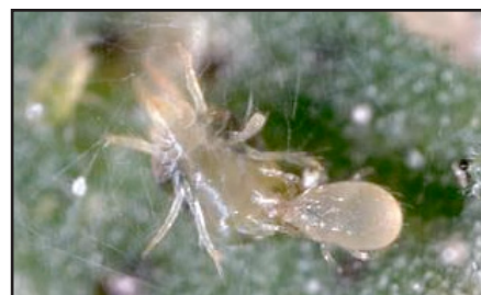
Figure 7. The western predatory mite, shown here attacking a two-spotted spider mite, is an important predator.